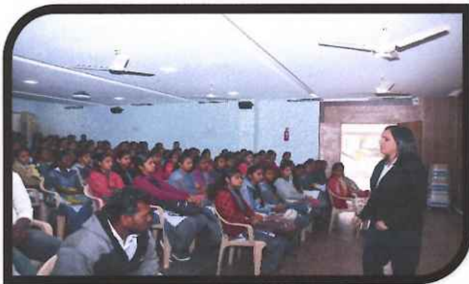
Guest Lecture Organized on Soft Skills & Personality Development