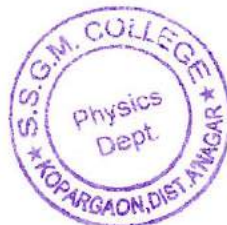
Head Department of Physics