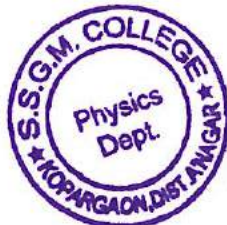
Head Department of Physics