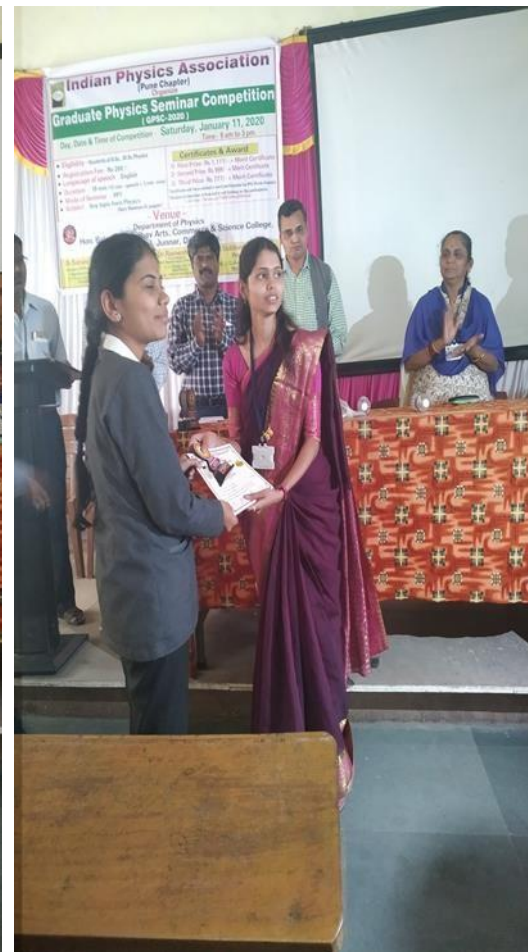
Indian Physics Association (Pune Chapter) Graduate Physics Seminar Competition-2020 January 11, 2020. Hon.B.J.Arts, Commerce and Science College, Ale,Tal.Junner Dist.Pune