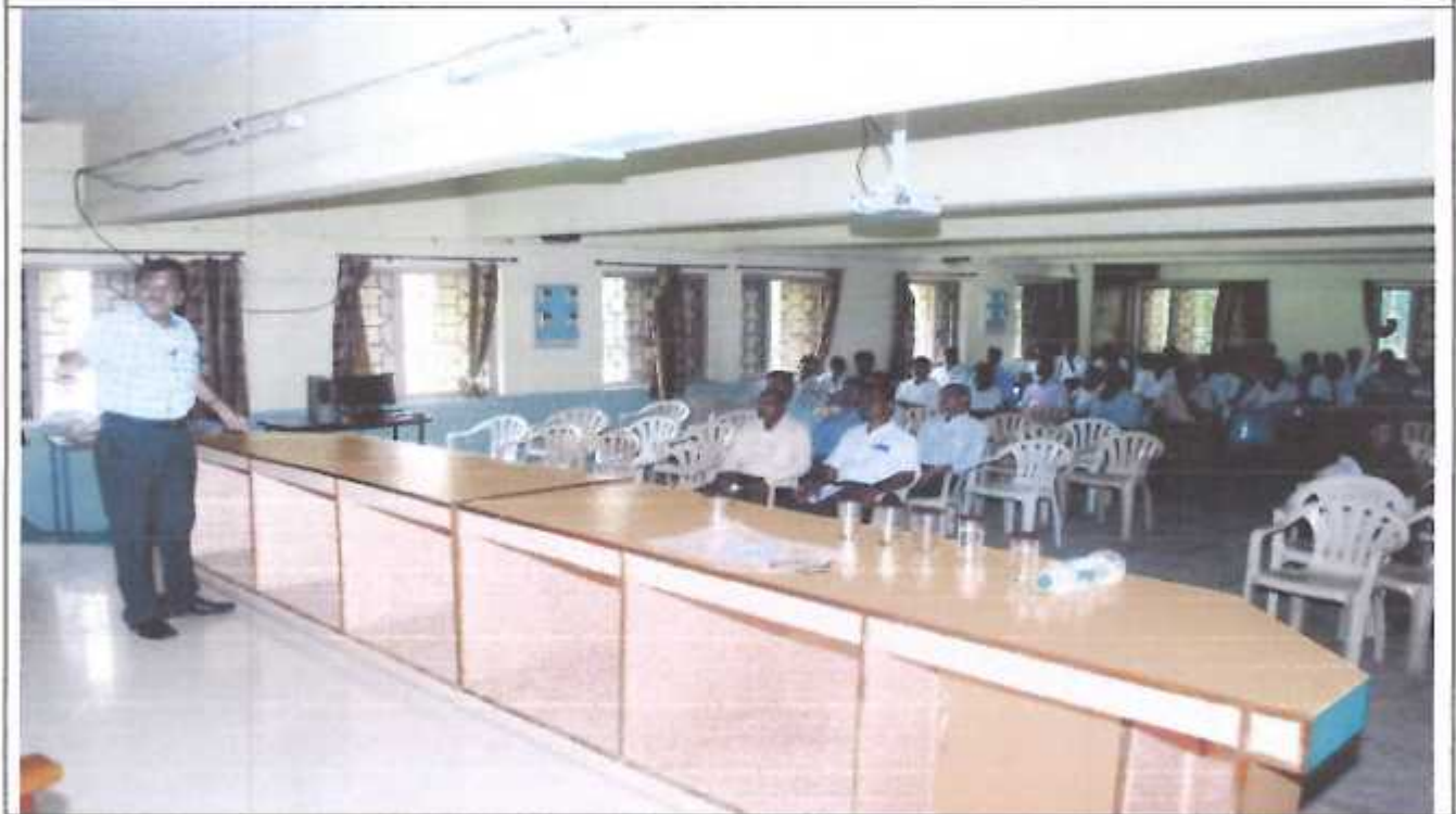
Coordinator Competitive Examination Committee