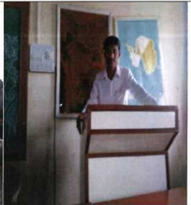
Coordinator Competitive Examination Committee