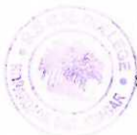
Principal S.S.G.M. College, Kopargaon