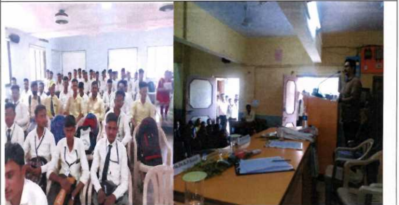
Coordinator Competitive Examination Committee