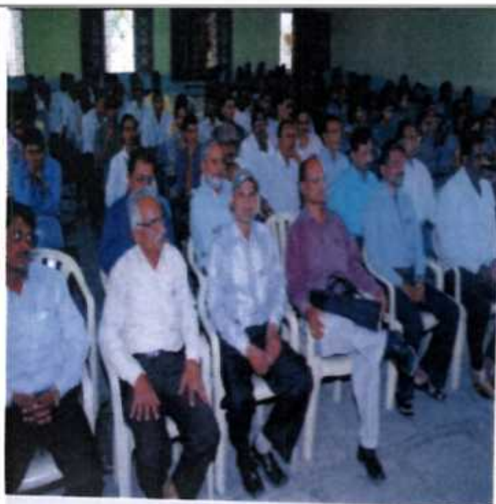
Coordinator Competitive Examination Committee