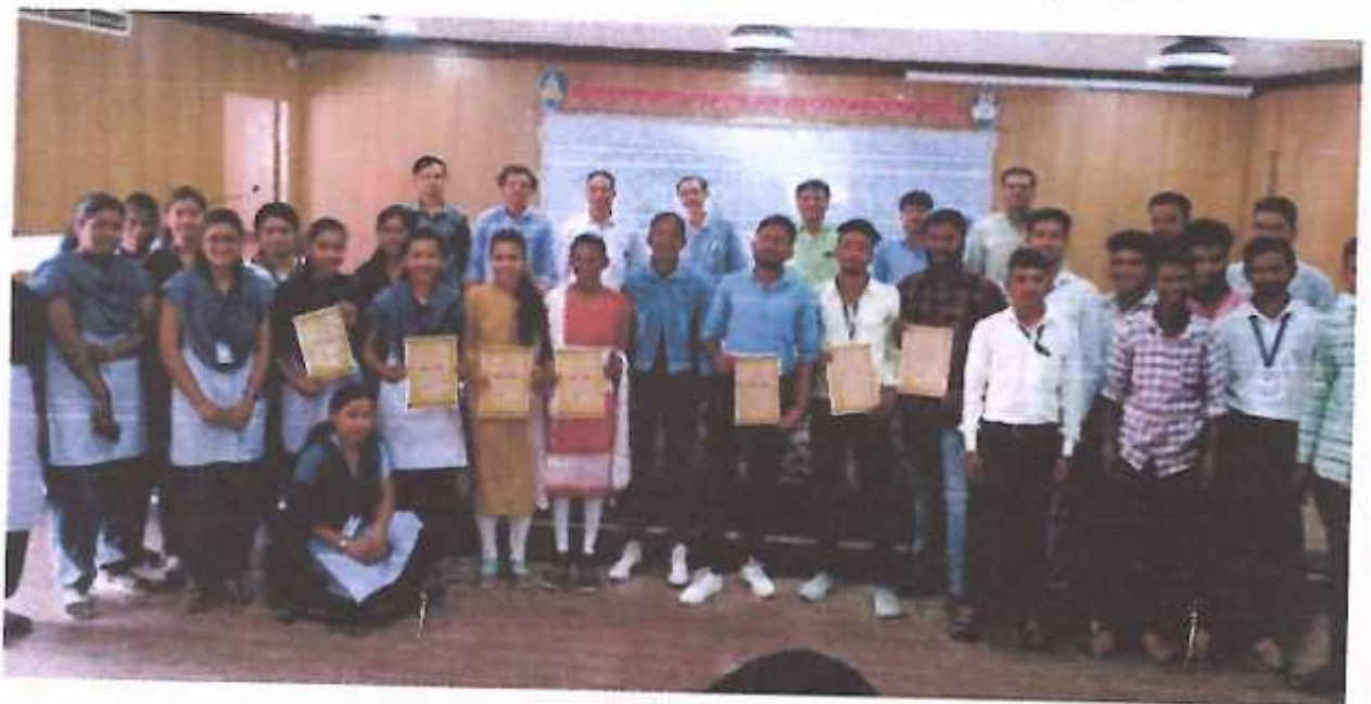
Participent Students with there passing certificate