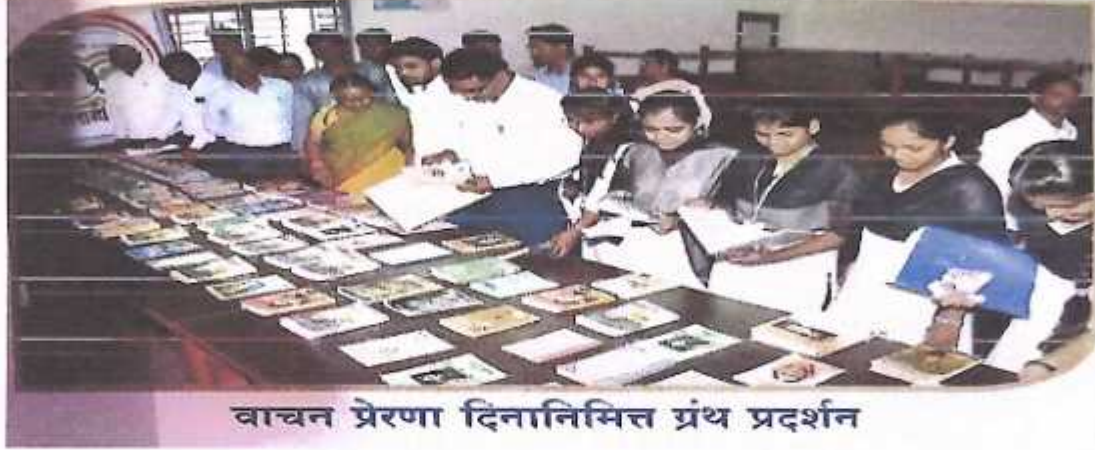
वाचन प्रेरणा दिनानिमित्त ग्रंथ प्रदर्शन