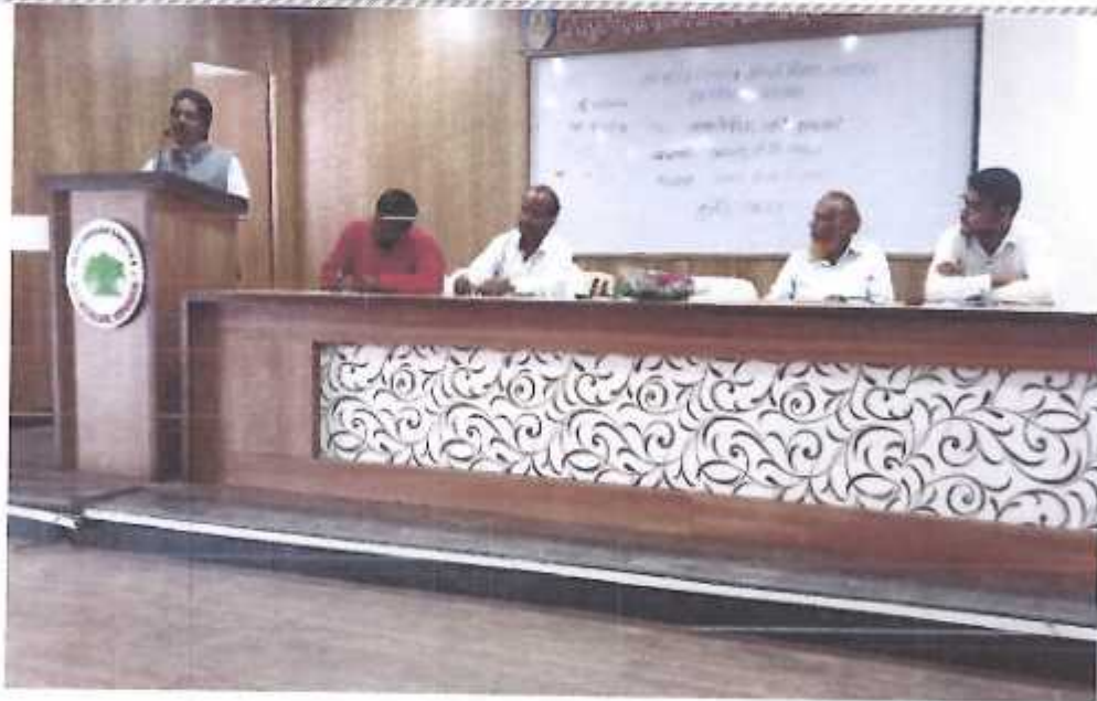
Head Cultural Department S.S.G.M. College, Kopargaon