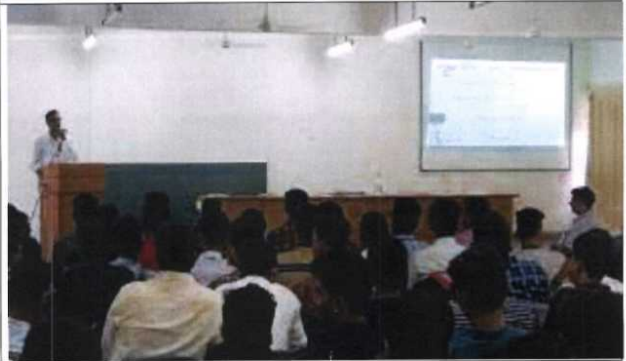
Coordinator Competitive Examination Committee

Number of Students Participated : 58 Video Lecture