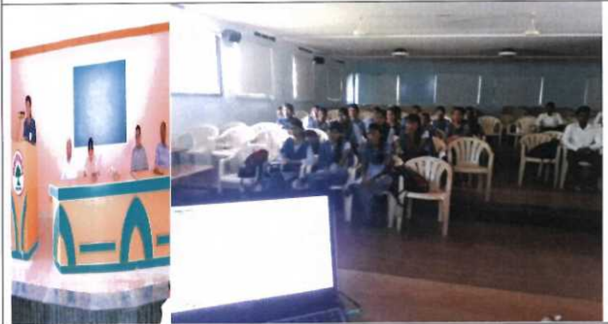
Coordinator Competitive Examination Committee

Number of Students Participated : 59 Video Lecture