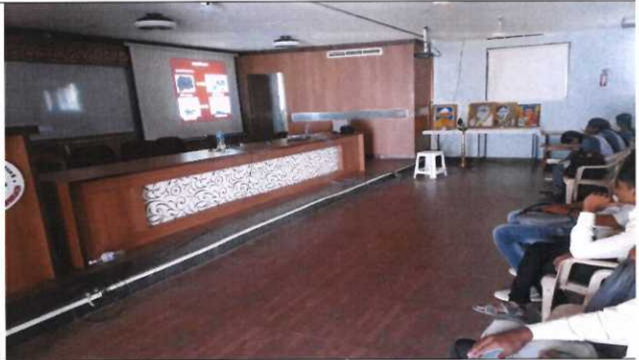
Coordinator Competitive Examination Committee

Number of Students Participated : 57 Video Lecture