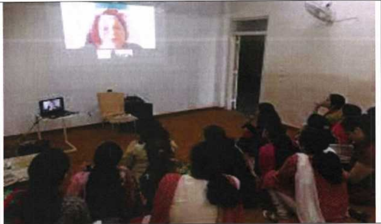
Coordinator Competitive Examination Committee

Number of Students Participated : 58 Video Lecture