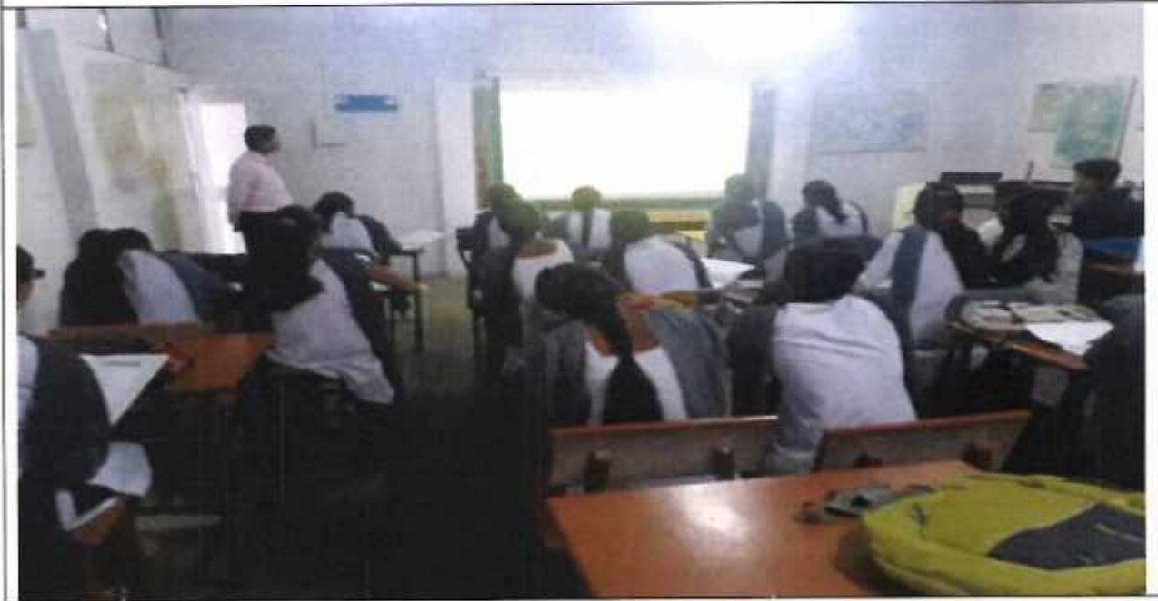
Coordinator Competitive Examination Committee

Number of Students Participated : 57 Video Lecture