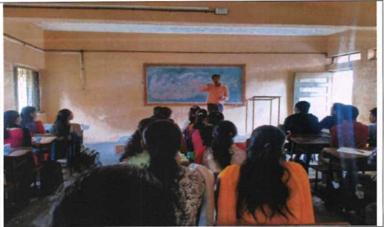
Coordinator Competitive Examination Committee