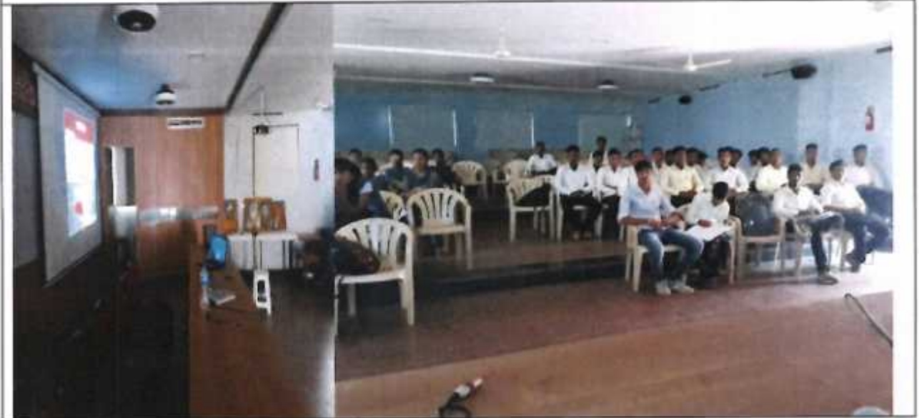
Coordinator Competitive Examination Committee

Number of Students Participated : 58 Video Lecture