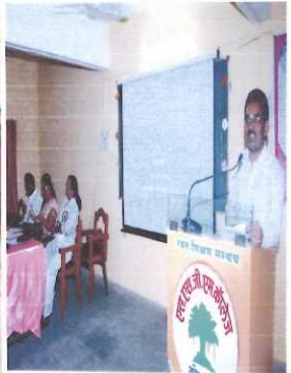
Coordinator Competitive Examination Committee