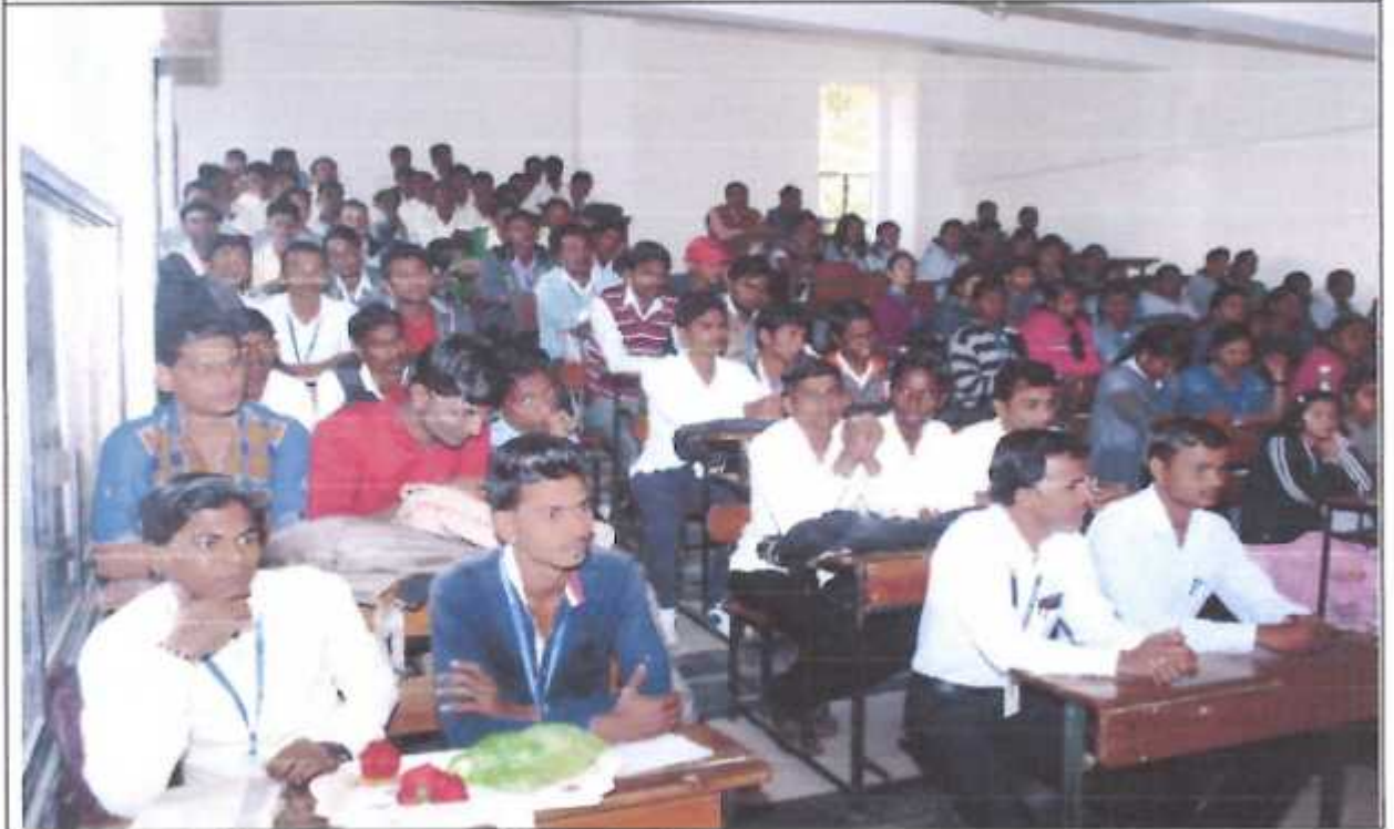
Coordinator Competitive Examination Committee