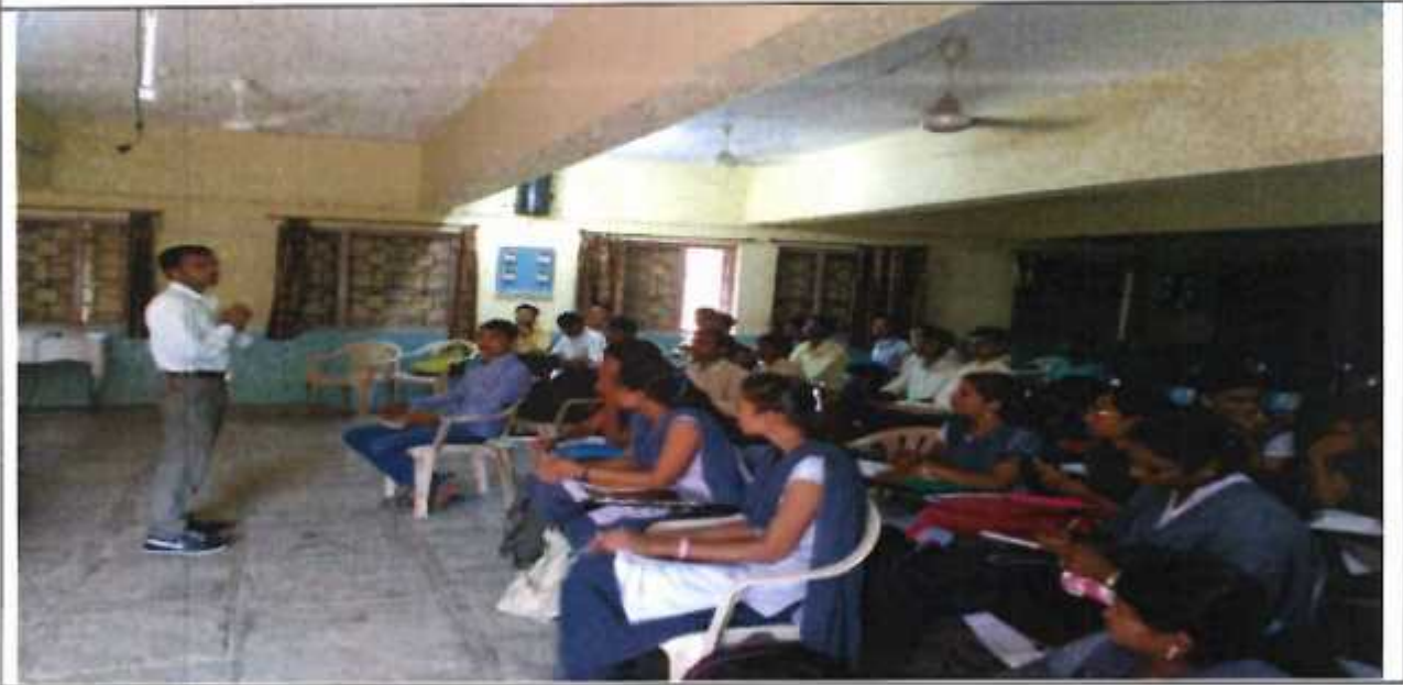
Coordinator Competitive Examination Committee

Number of Students Participated : 59 Video Lecture