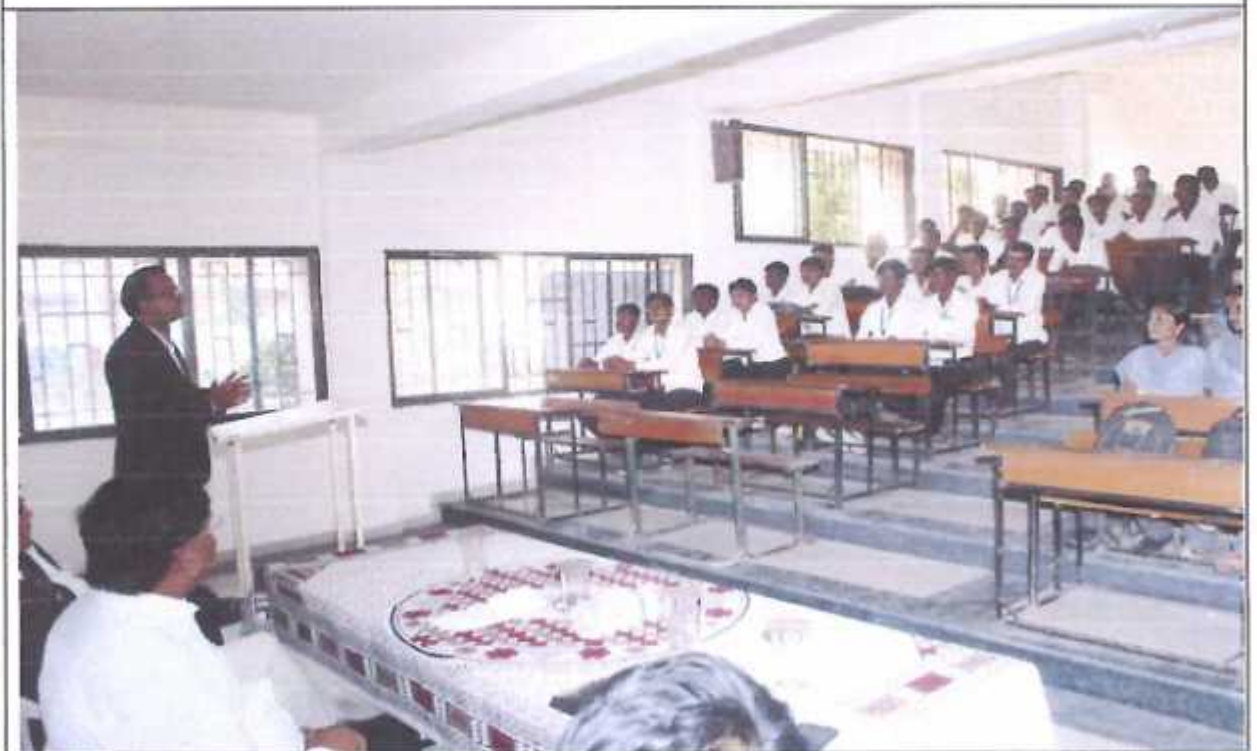
Coordinator Competitive Examination Committee