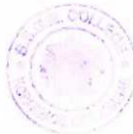
Principal S.S.G.M. College, Kopargaon