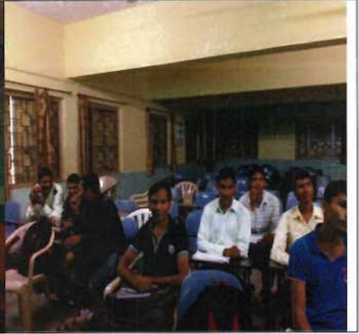
Coordinator Competitive Examination Committee