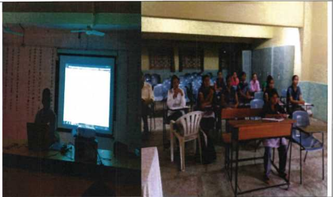
Coordinator Competitive Examination Committee

Number of Students Participated : 59 Video Lecture