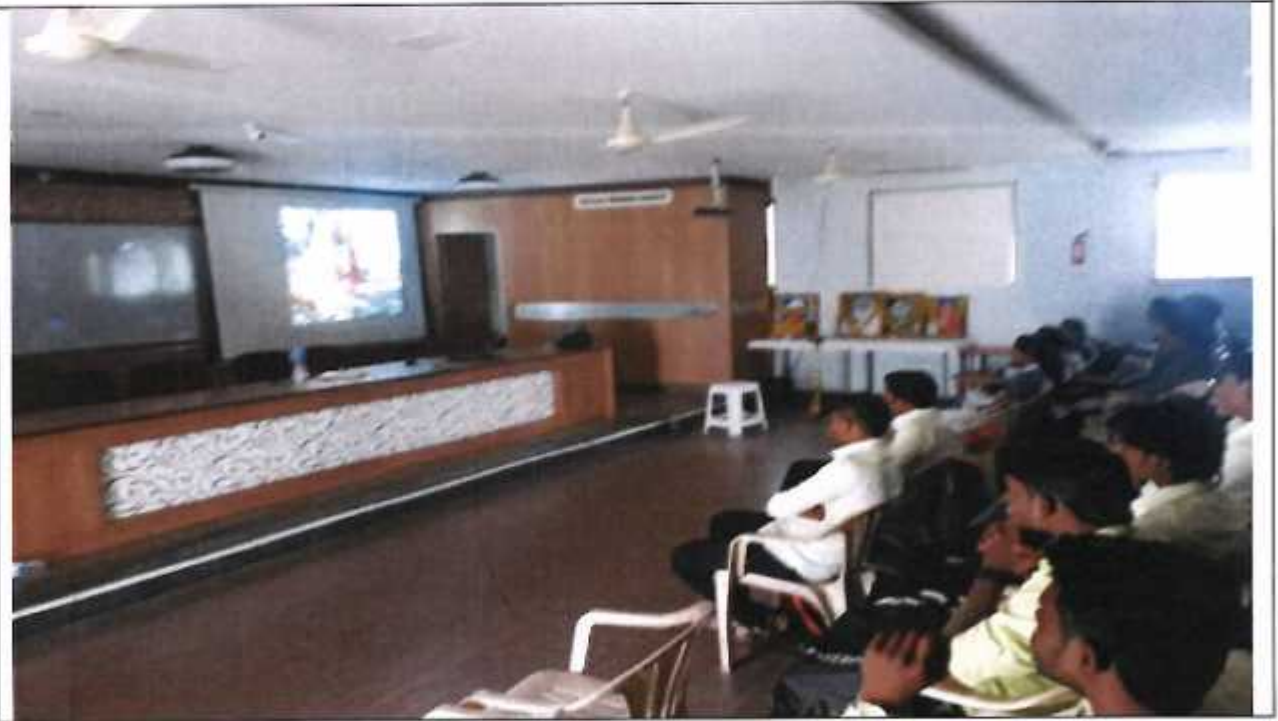
Coordinator Competitive Examination Committee

Number of Students Participated : 58 Video Lecture