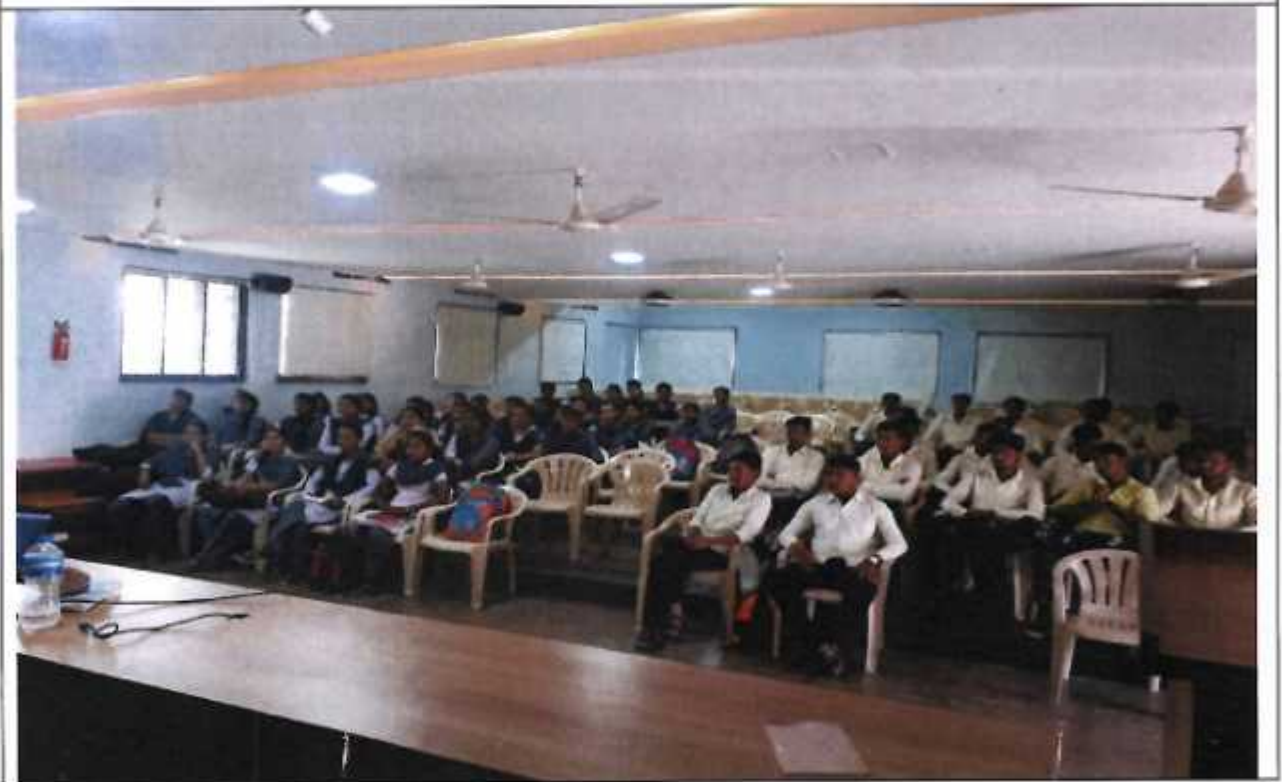
Coordinator Competitive Examination Committee

Number of Students Participated : 59 Video Lecture