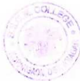
Principal S.S.G.M. College, Kopargaon