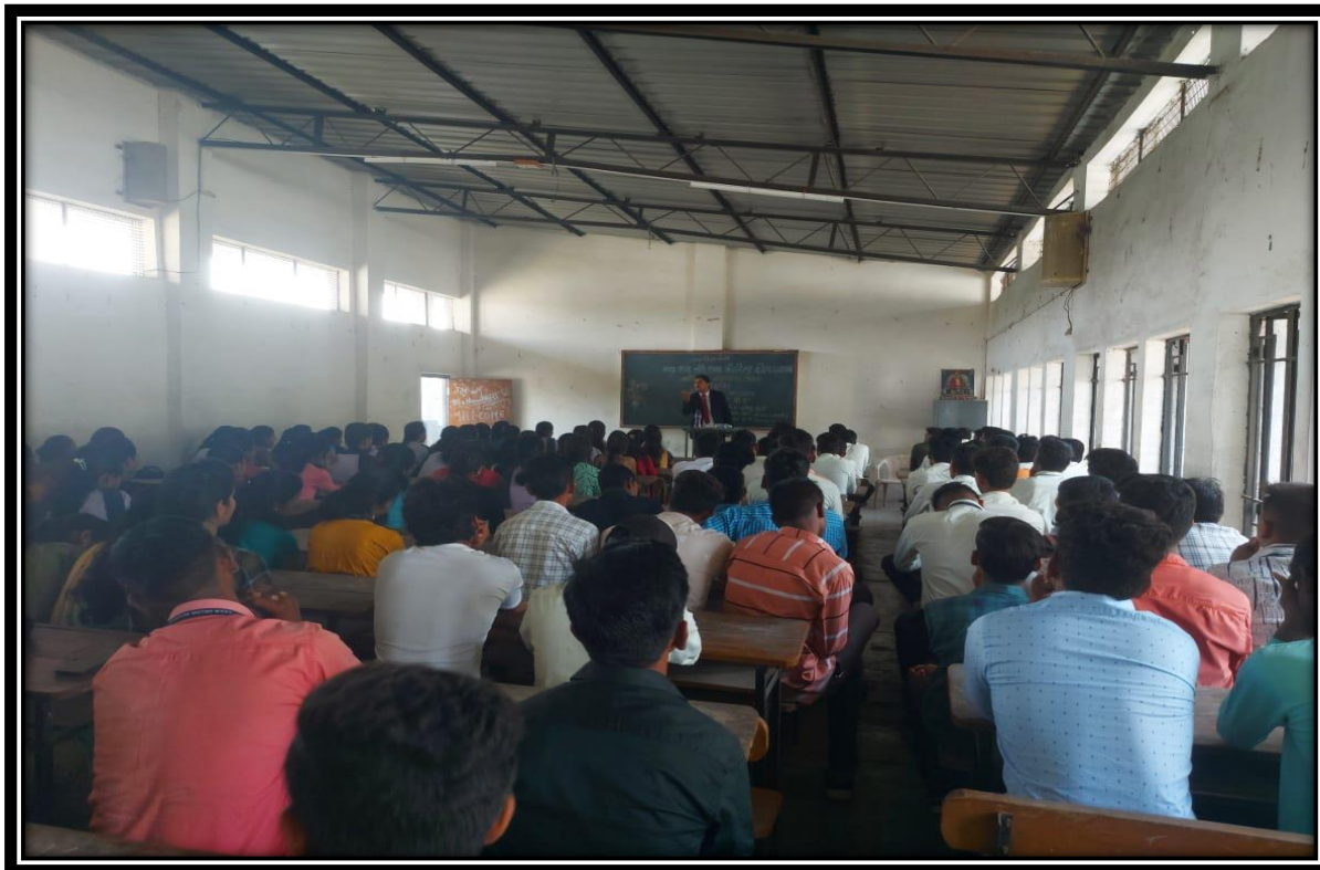
Guest Lecture on “Career Opportunities in Management” Saturday, 28 th December 2018 at 9.00 am.