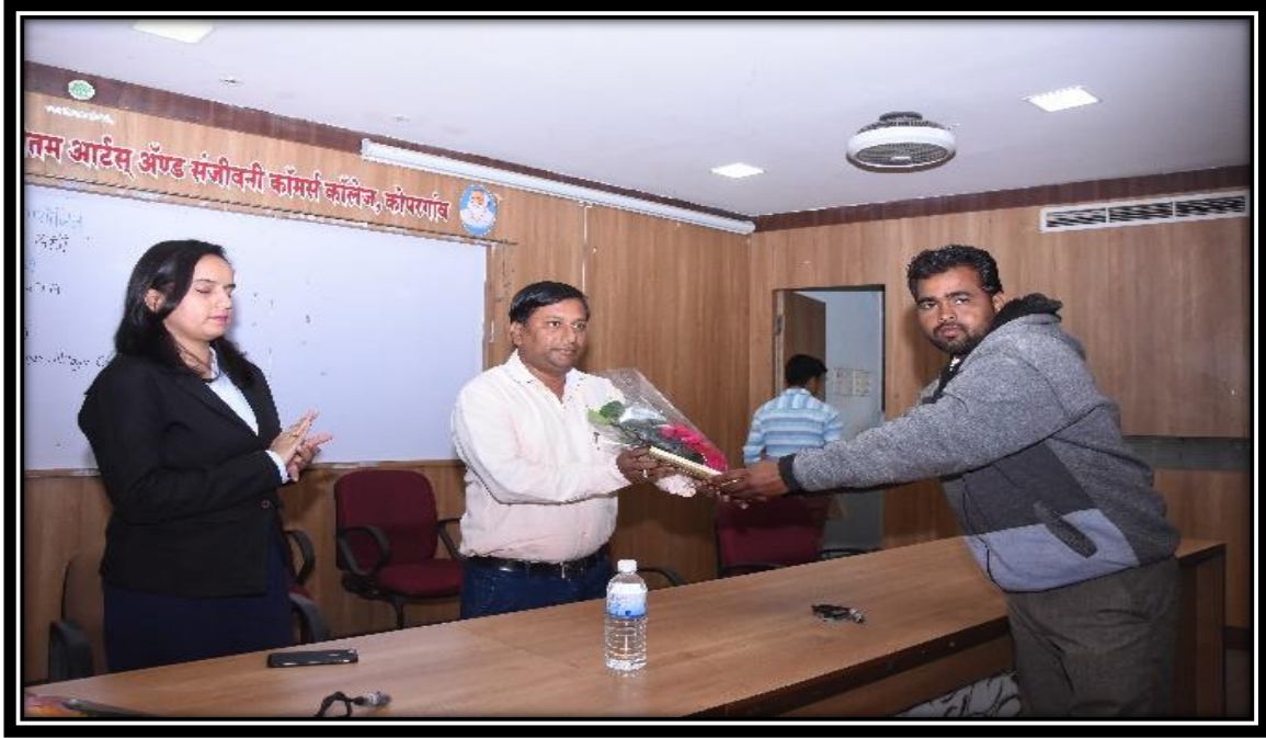
One Day Workshop on the theme of “GST & Smart Career in Commerce” on 22 nd December 2017 at 9.30 am