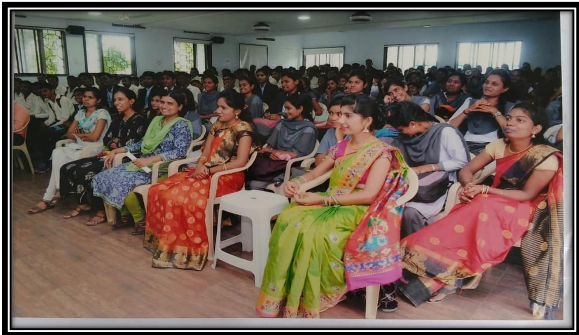
Training Program on “Campus Placement Drive by Rubicon Pvt Ltd” 16 th to 18 th September 2019 at 10.00 am.