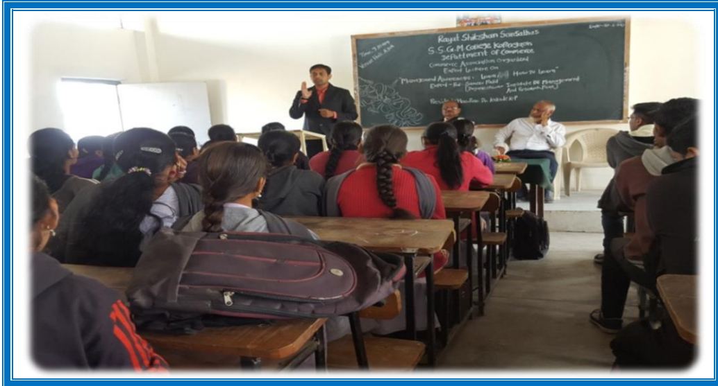
One Day Workshop on the theme of “Computerized Accounting” on Tuesday, 20 th August 2018 at 9:00 am