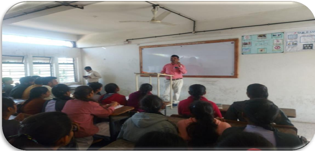
One Day Workshop on “GST with Tally” Thursday, 23 rd September 2019, Time- 9:15 am