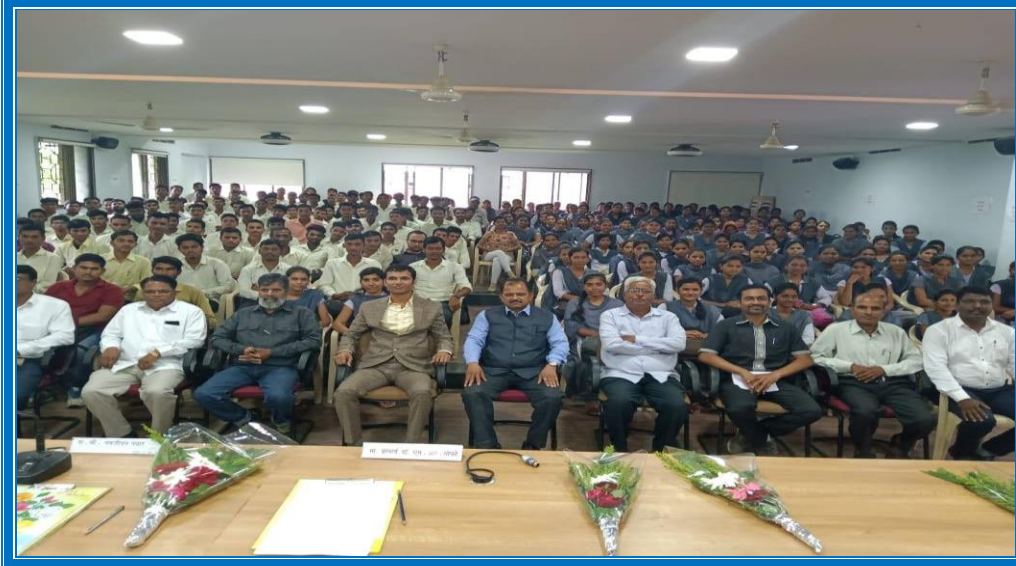
One Day Workshop on the theme of “Accounting Software Tally ERP- 9” on Tuesday, 17 th December 2019 at 9:00 am