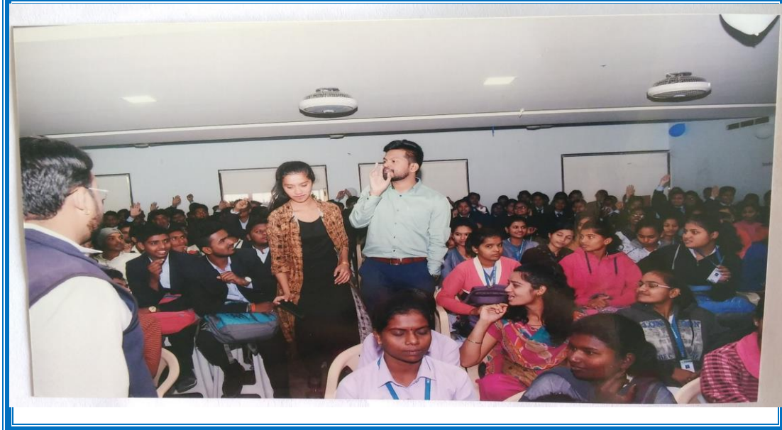
One Day Workshop on the theme of “How to Become Entrepreneur” Saturday, 28 th December 2019 at 9:00 am