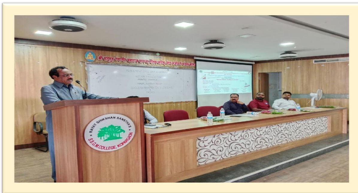
Guest Lecture on “Success Mantra-Intelligence Skills” Thursday, 1 st December 2022 at 10.00 am.