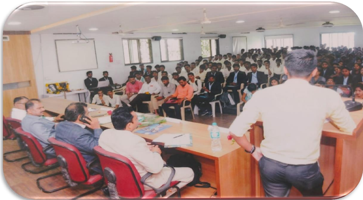
Training Program on “Career and Opportunities in Retail Marketing” Friday, 7 th February 2020, Time- 10:00 am to 1:00 pm