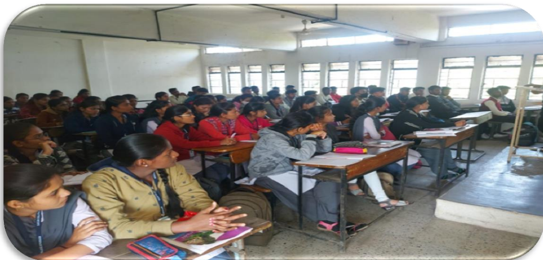
One Day Workshop on “GST with Tally” Thursday, 23 rd Sepetember 2019, Time- 9:15 am