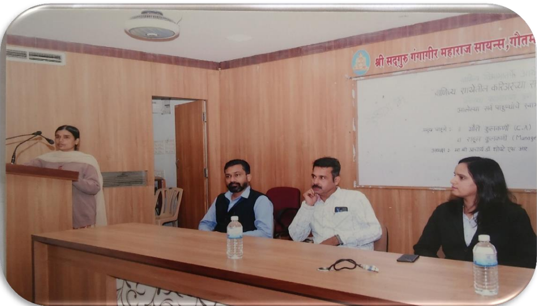
Guest Lecture on Career Development in Banking Sector Monday 3 rd February 2020 at 09:30 am. to 10: 30 am.