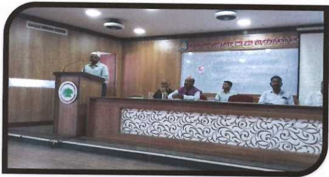
Guest Lecture Organized on E- Commerce