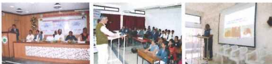
Some memorable events/photographs during the conference