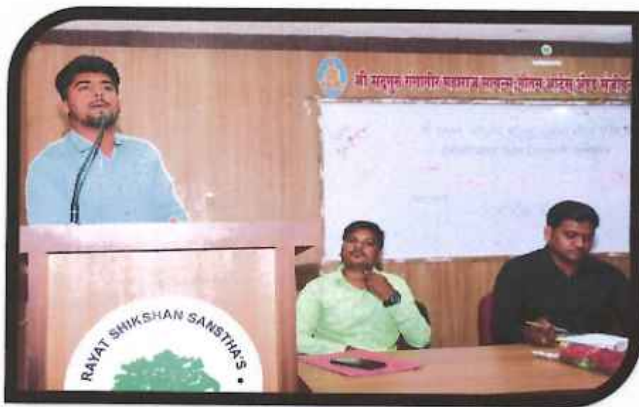
Guest Lecture organized on Career in Banking Sector