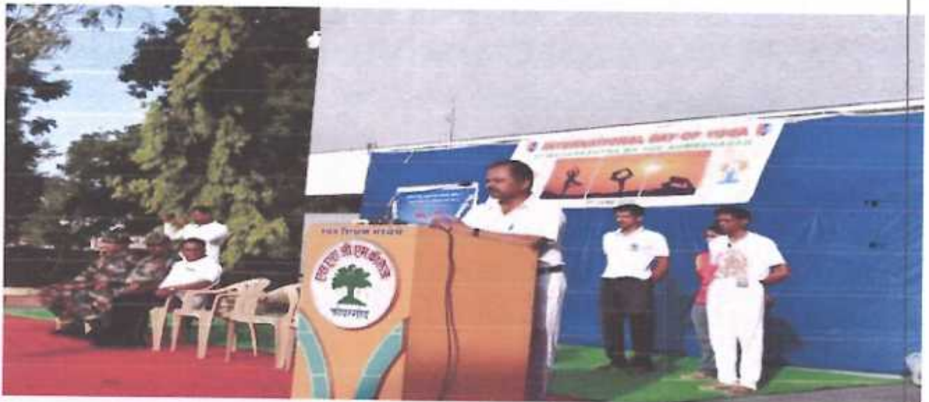
Director of Sports and Physical Education S.S.G.M.Science,Gautam Arts & Sanjivani Commerce College,Kopergaon