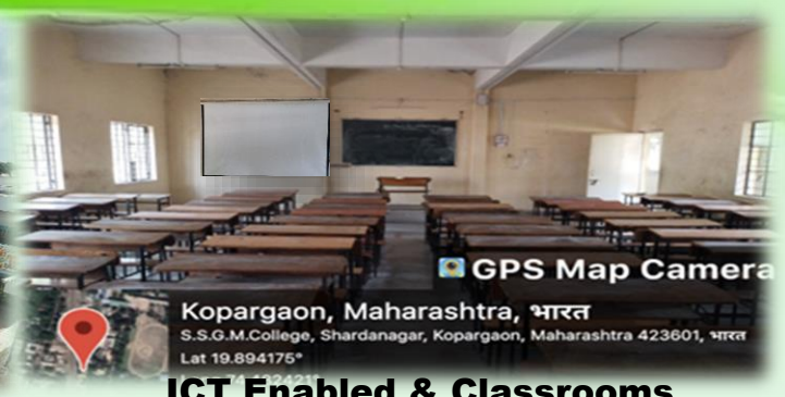
ICT Enabled & Classrooms