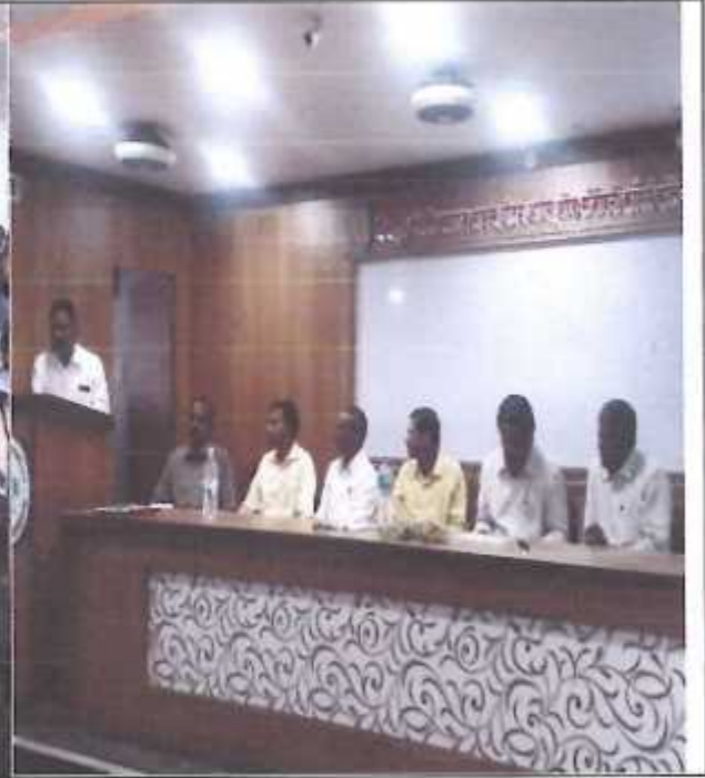
Coordinator Competitive Examination Committee