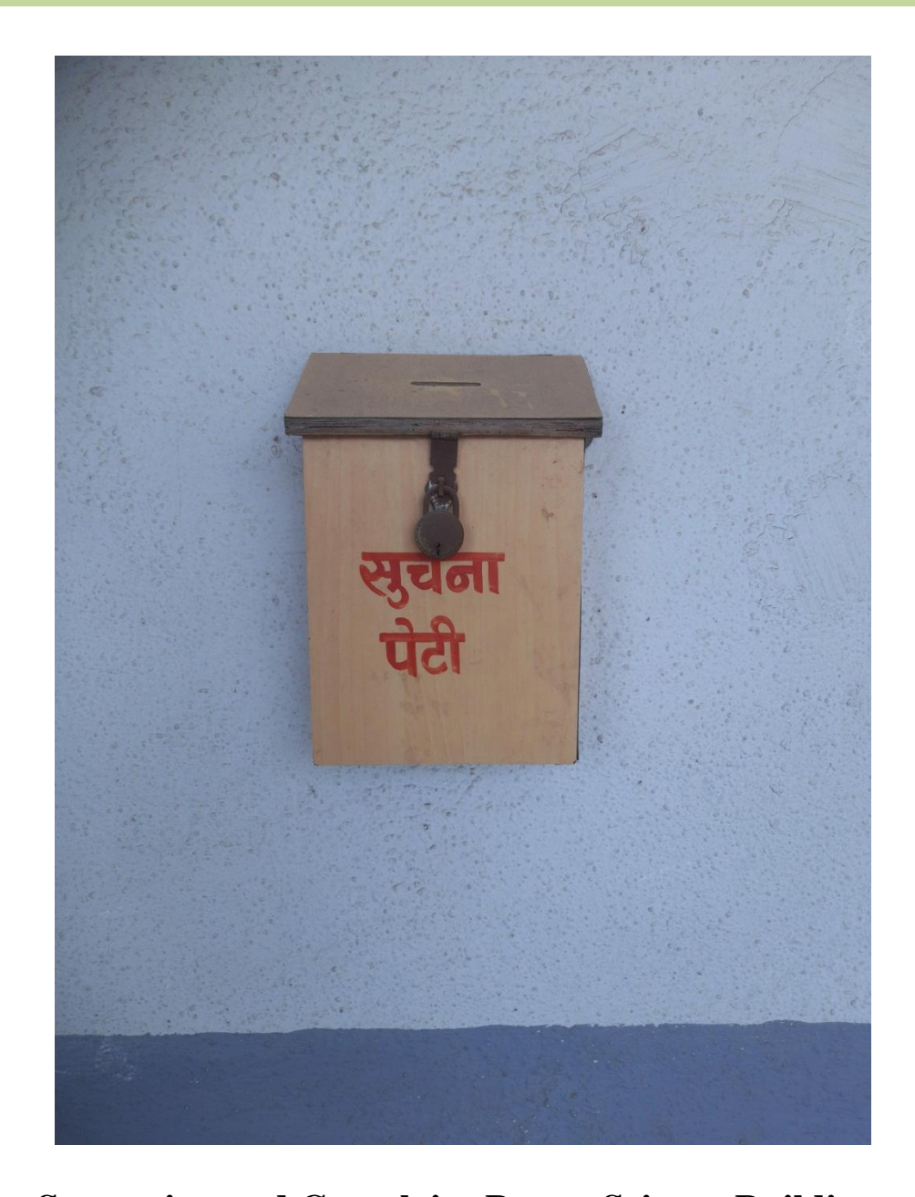
Suggestion and Complaint Box at Science Building