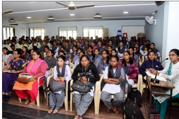
Hon.Korhale S.B.-District Judge,Kopergaon