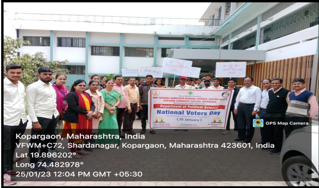
Voter Awareness Rally