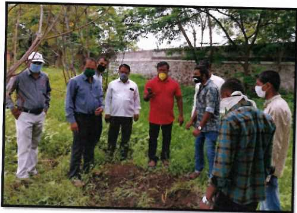
Plantation was done by Principal, vice-principal, Teaching staff and Students