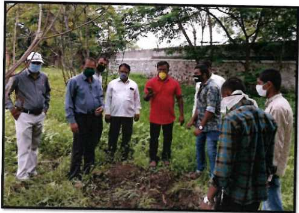
Plantation was done by Principal, vice-principal, Teaching staff and Students