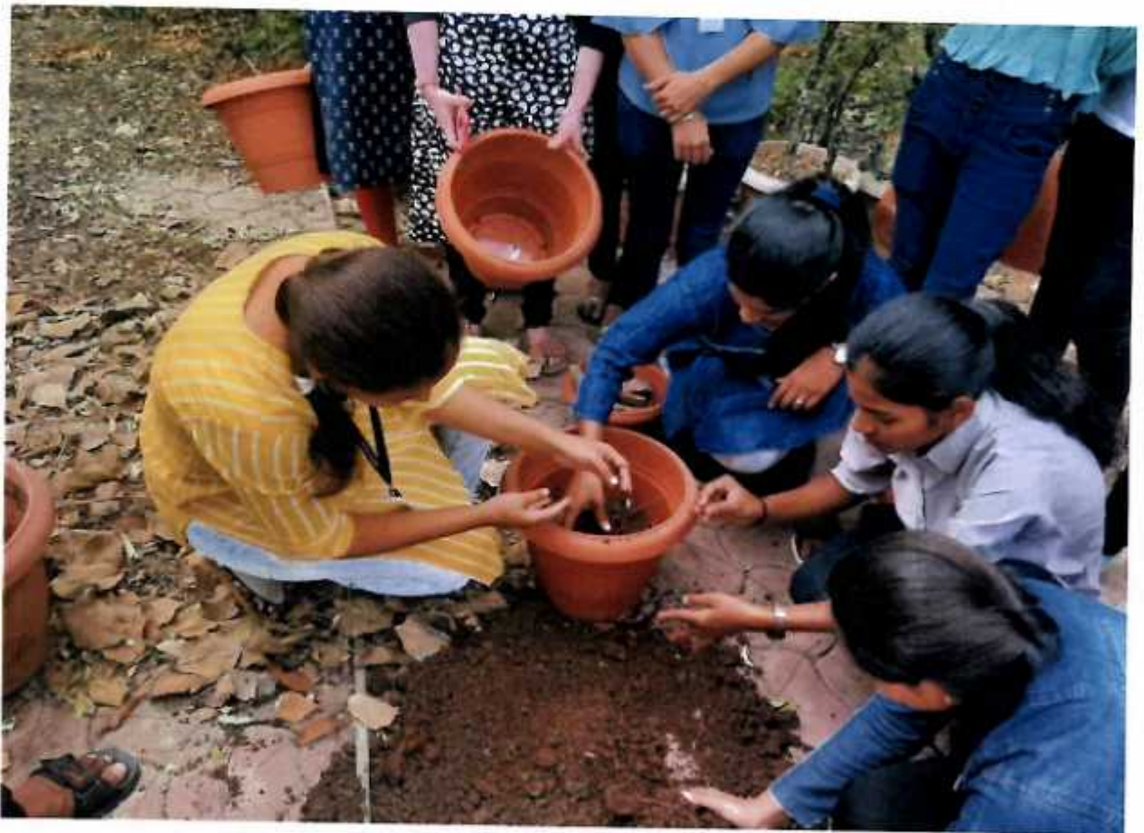
Extension activity:- Nursery Management 2022-23