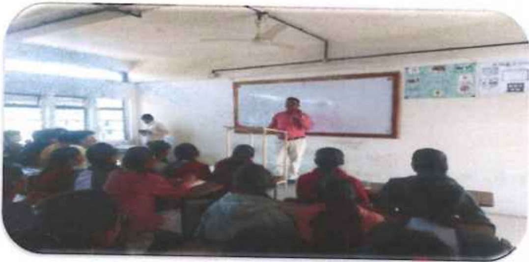
One Day Workshop on "GST with Tally" Thursday, 23 rd Sepetember 2019, Time- 9:15 am