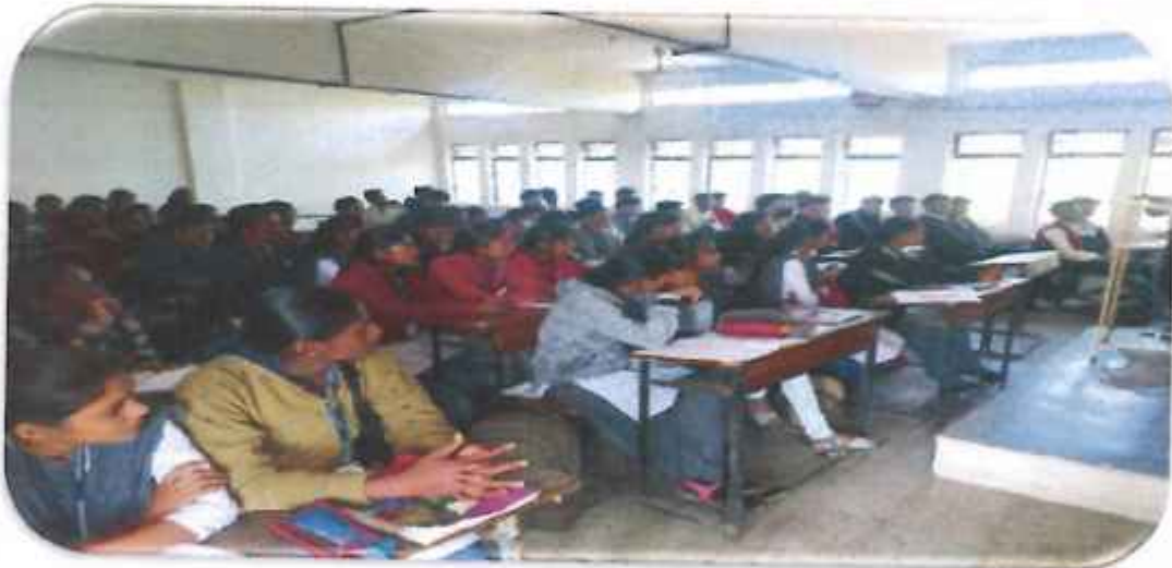
One Day Workshop on "GST with Tally" Thursday, 23 rd Sepetember 2019, Time- 9:15 am