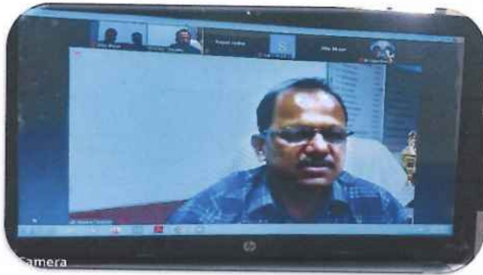
One Day Online Webinar on the theme of "Bharat Abhiman" on 16 th February 2021 at 11.00 am