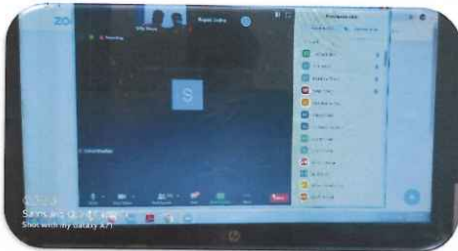
One Day Online Webinar on the theme of "Bharat Abhiman" on 16 th February 2021 at 11.00 am