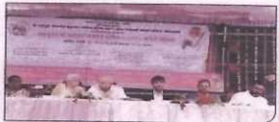
कर्मवीर जयंती निमित्त उपस्थित मान्यवर