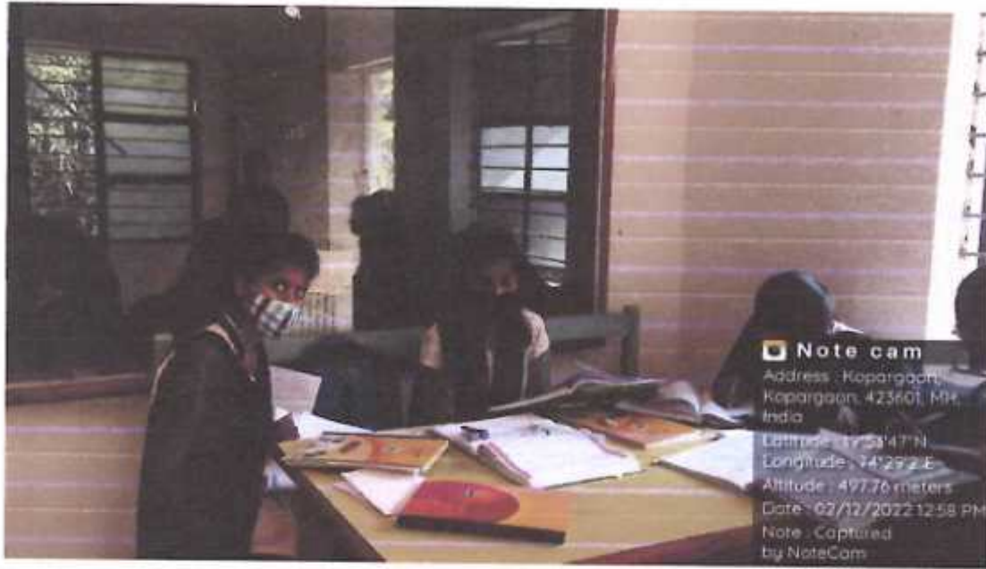
Girls studying in common room