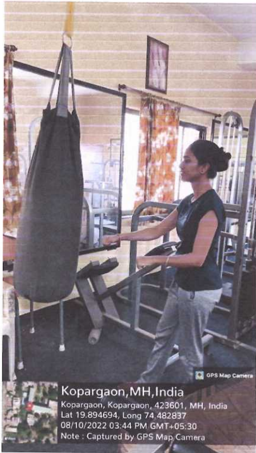
Girl's workout in Gymnasium