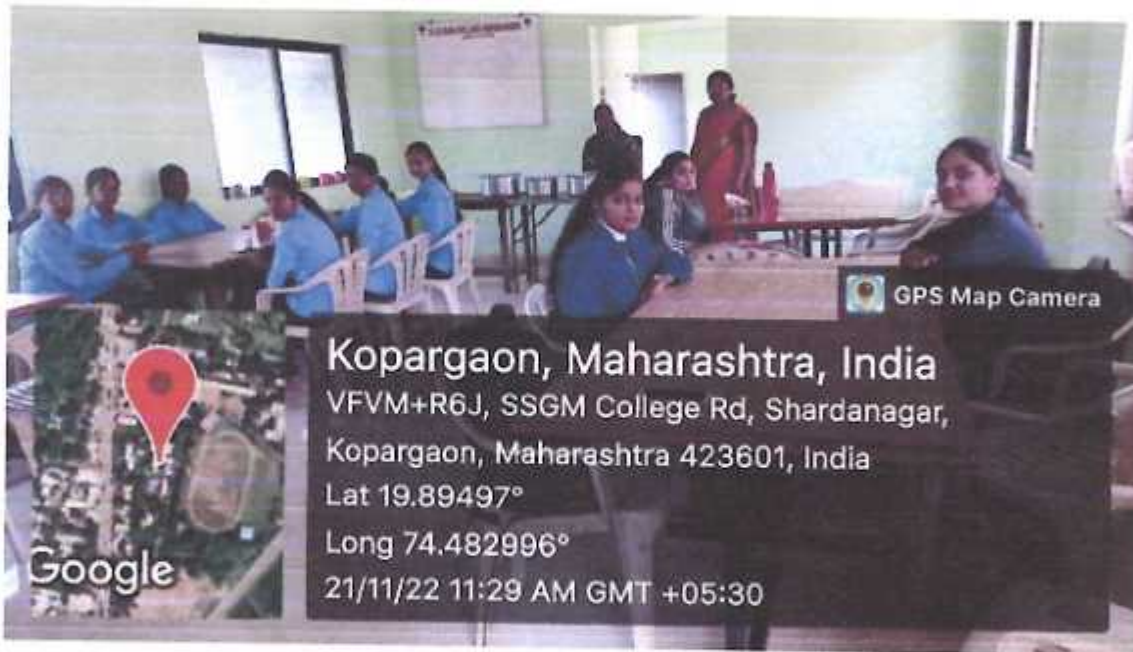
Dining Hall at Girls Hostel

The college management is keen about the cleanliness and hygiene in hostels. The Hostel Committee is taking care of the facilities provided to girls. The hostels are provided with necessary facilities like mess hall, gymnasium, separate TV room and newspapers.