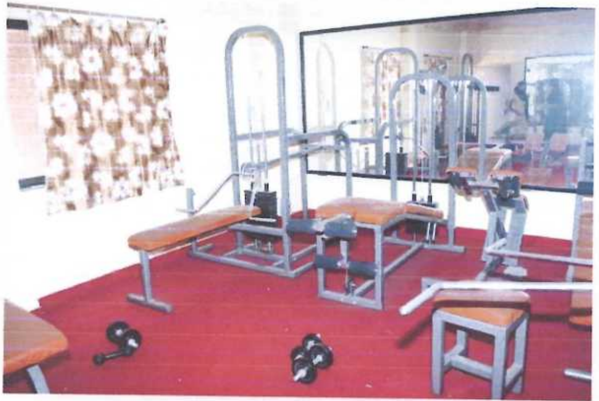
Gymnasium at Girls Hostel

2. Separate and Well Equipped Gymnasium Facility: The College take care of girl's health by providing a good quality of food in mess and separate of gymnasium in girl's hostel.