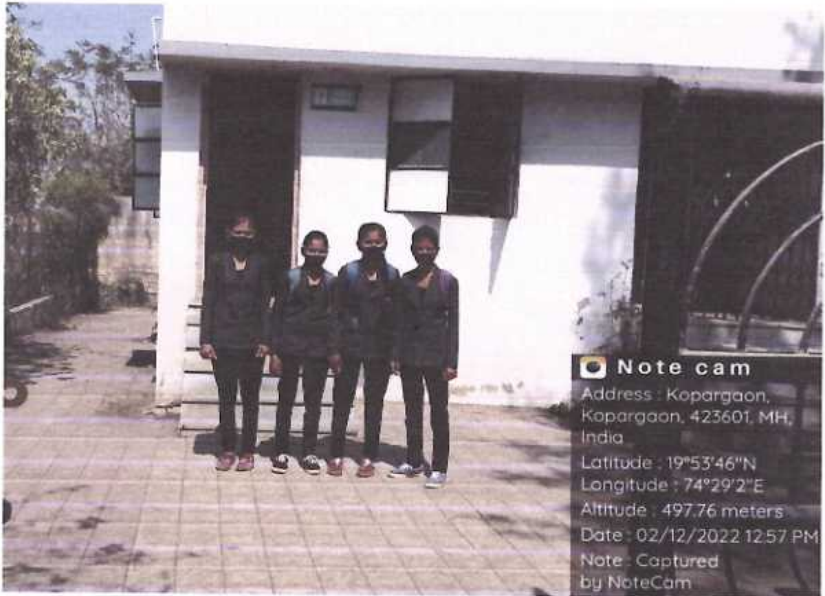
Common room for girls and ladies staff

3. Common rooms: To spend the leisure time, two ladies common rooms are made available with all facilities.