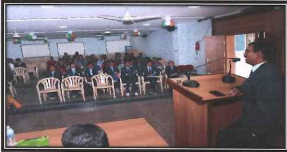
One Day Workshop on the theme of "Guidance for M.B.A. CET Exam" on 24 th January 2019 at 10.30 am.