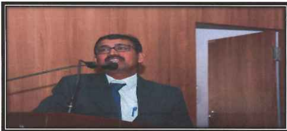
One Day Workshop on the theme of "Guidance for M.B.A. CET Exam" on 24 th January 2019 at 10.30 am.