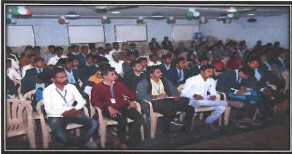
One Day Workshop on the theme of "Guidance for M.B.A. CET Exam" on 24 th January 2019 at 10.30 am.