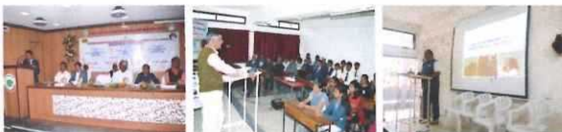
Some memorable events/photographs during the conference