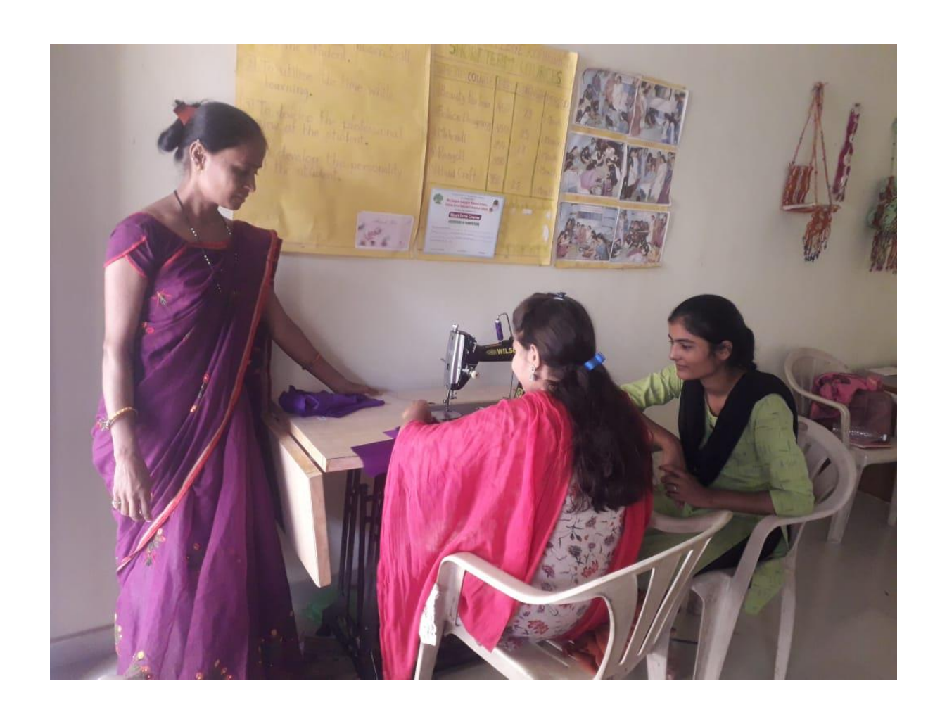
Short Term Courses in Fashion Designing