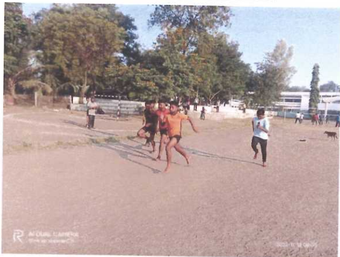
Use of playground by police and army recruitment aspirants