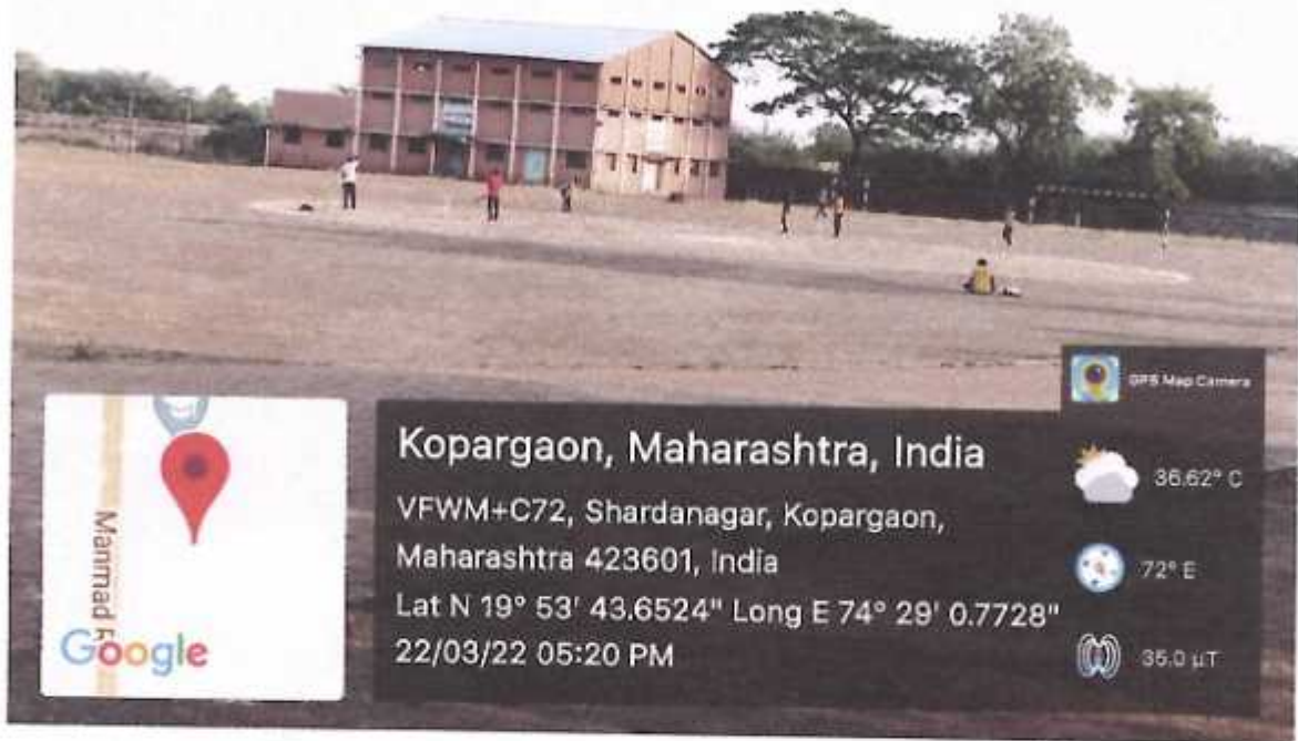
Use of playground for playing cricket