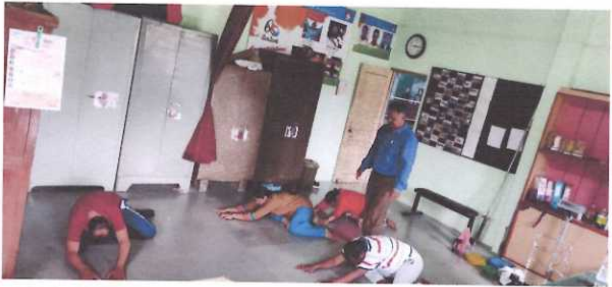
Physical Director giving yoga & physiotherapy training to senior citizens