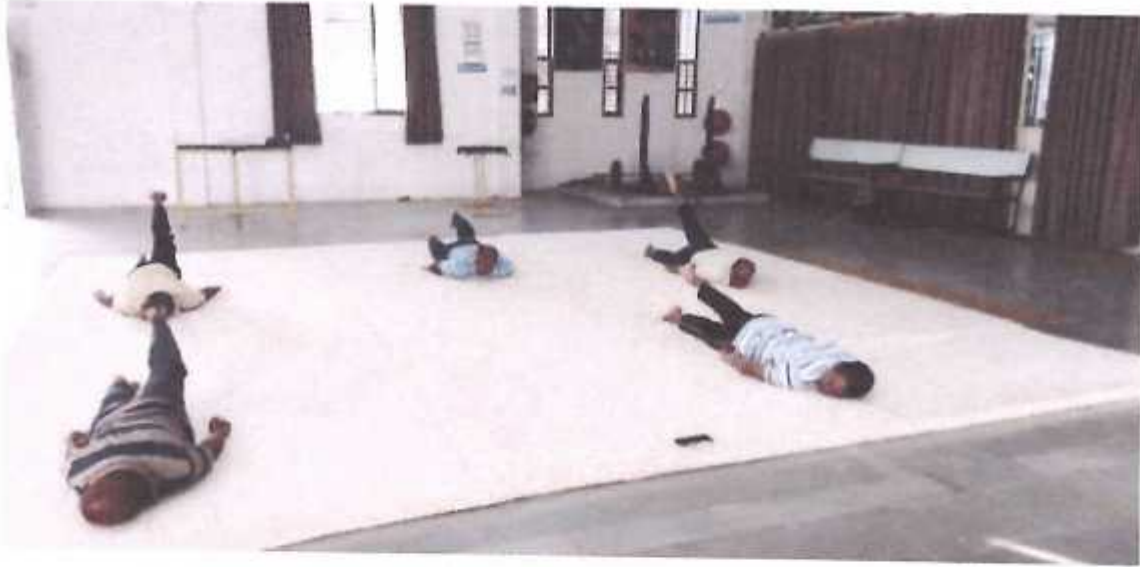
Yoga exercise by senior citizens