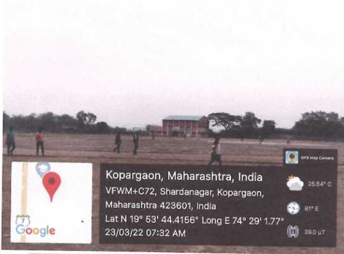
Use of playground for evening walk