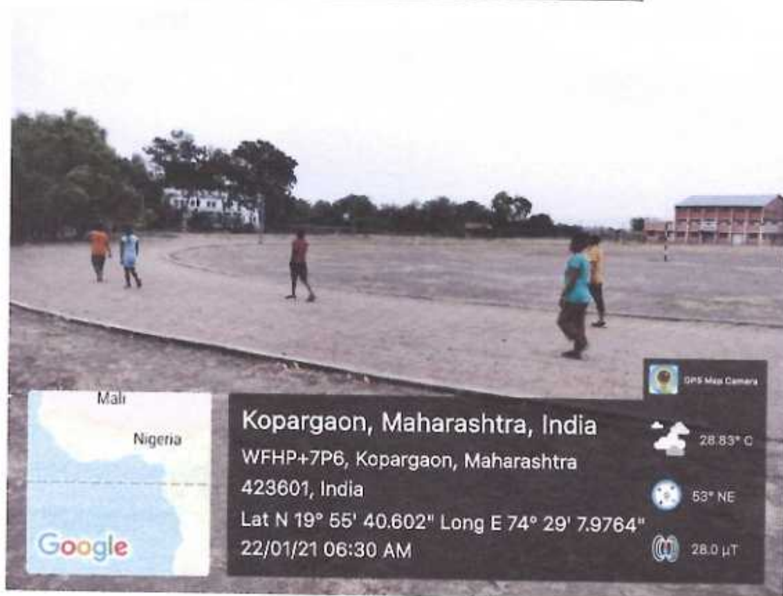
Use of playground by ladies for morning walk

[Signature] Principal S.S.G.M.College Kopargaon