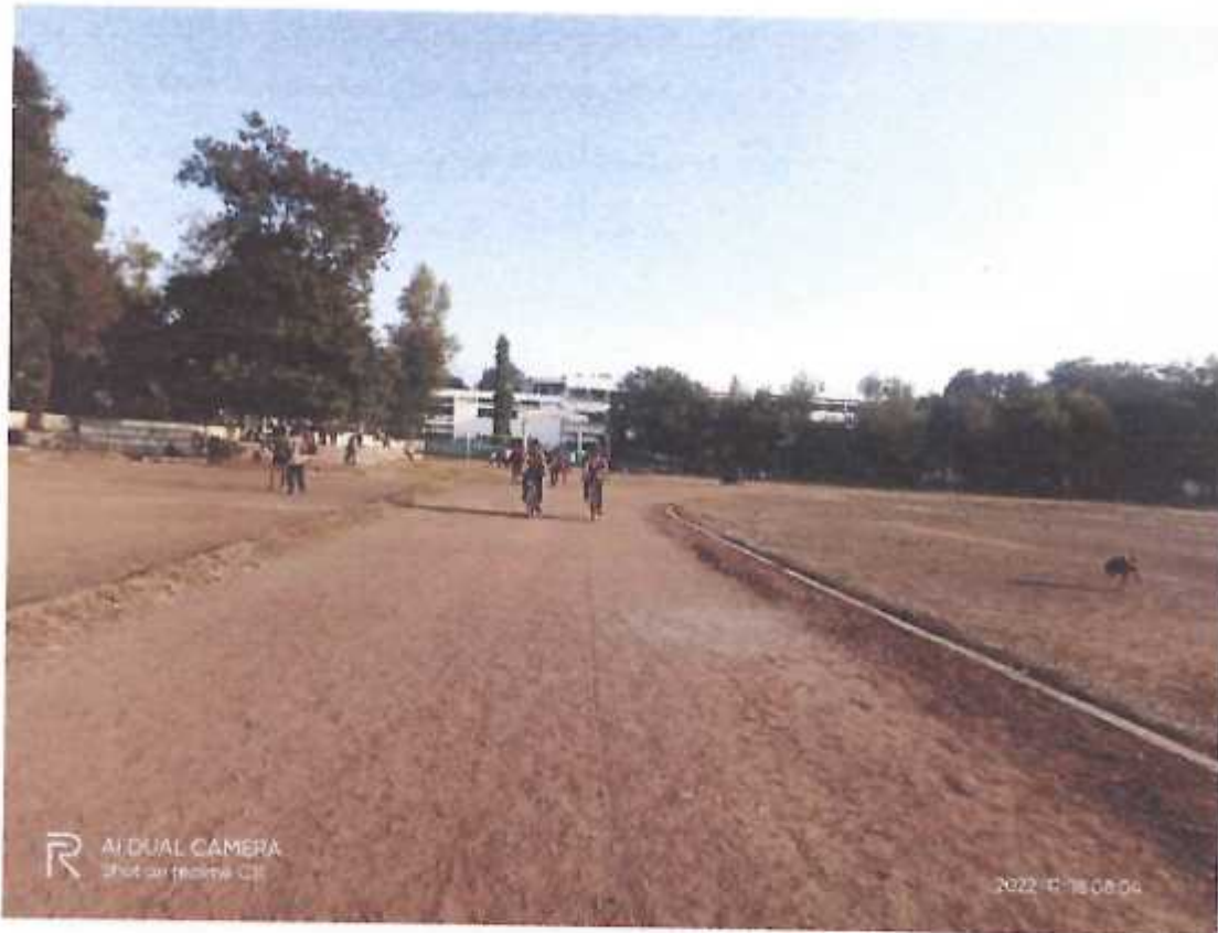
Use of playground for cycling