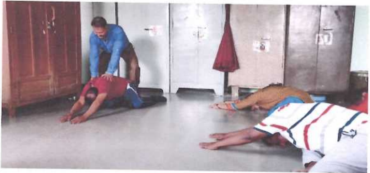
Physical Director giving yoga & physiotherapy training to senior citizens