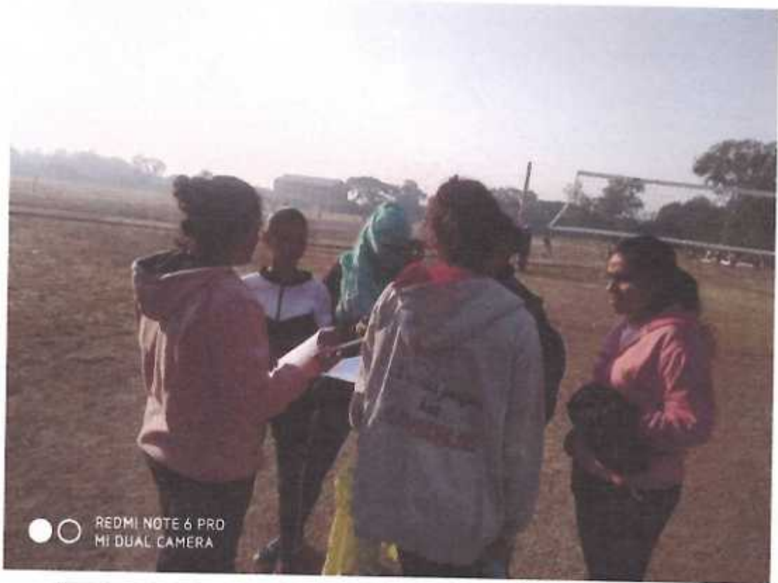
Police recruitment aspirants giving feedback