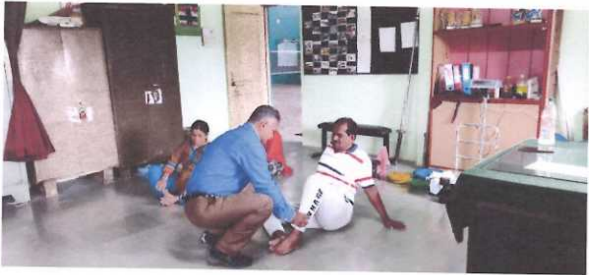
Physical Director giving yoga & physiotherapy training to senior citizens