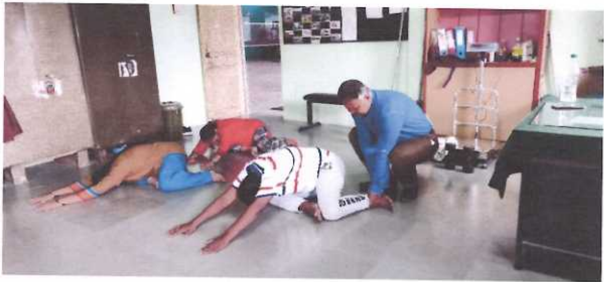
Physical Director giving yoga & physiotherapy training to senior citizens