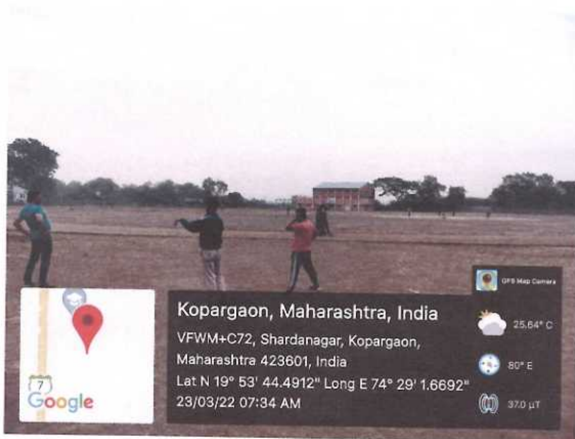
Use of playground for exercise