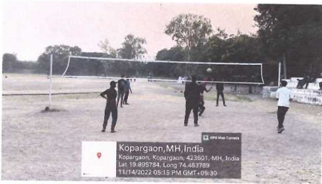
Use of playground for playing volley ball