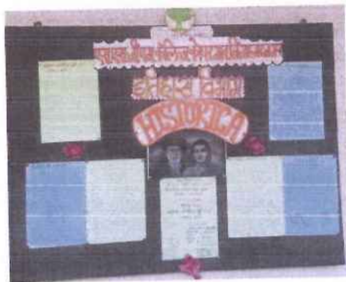
Inauguration of wallpaper.