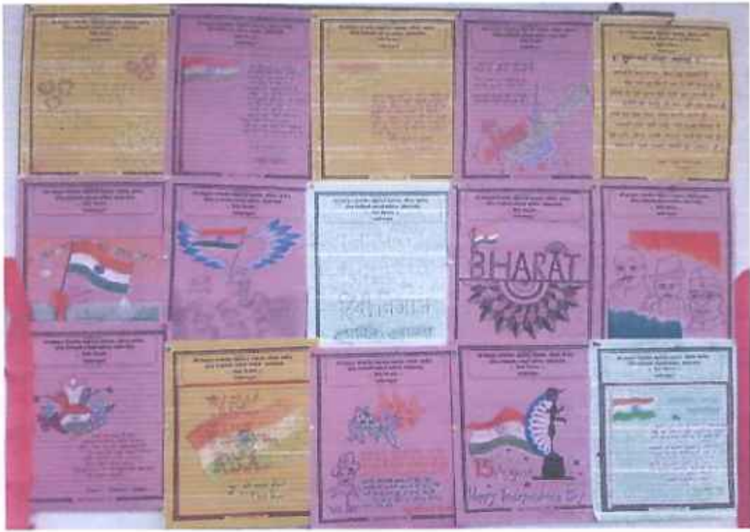
हिंदी विभाग- 'साहित्यसुधा' भित्तिपत्रक