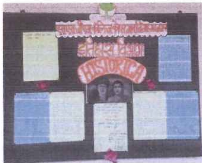
Inauguration of wallpaper.