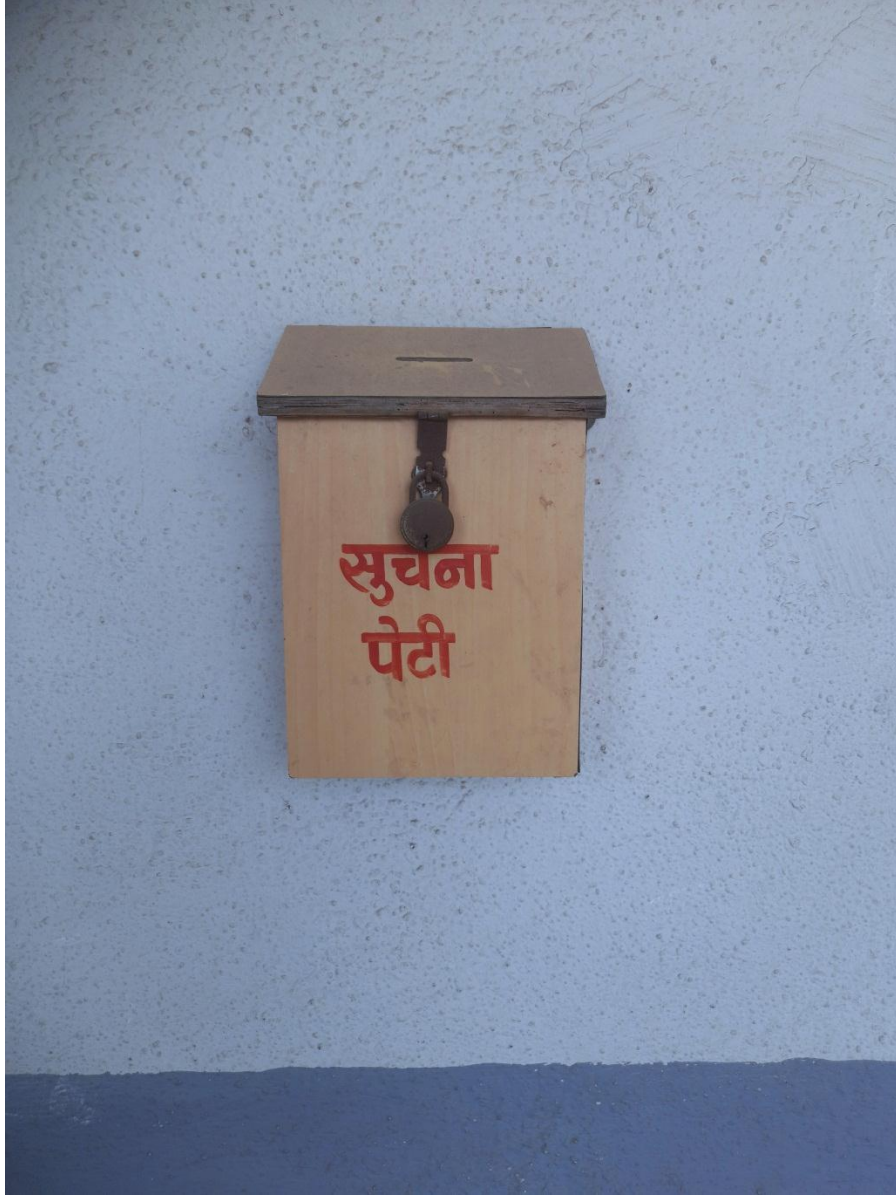
Suggestion and Complaint Box at Science Building

Shri Sadguru Gangageer Maharaj Science, Gautam Arts and Sanjivani Commerce College, Kopargaon