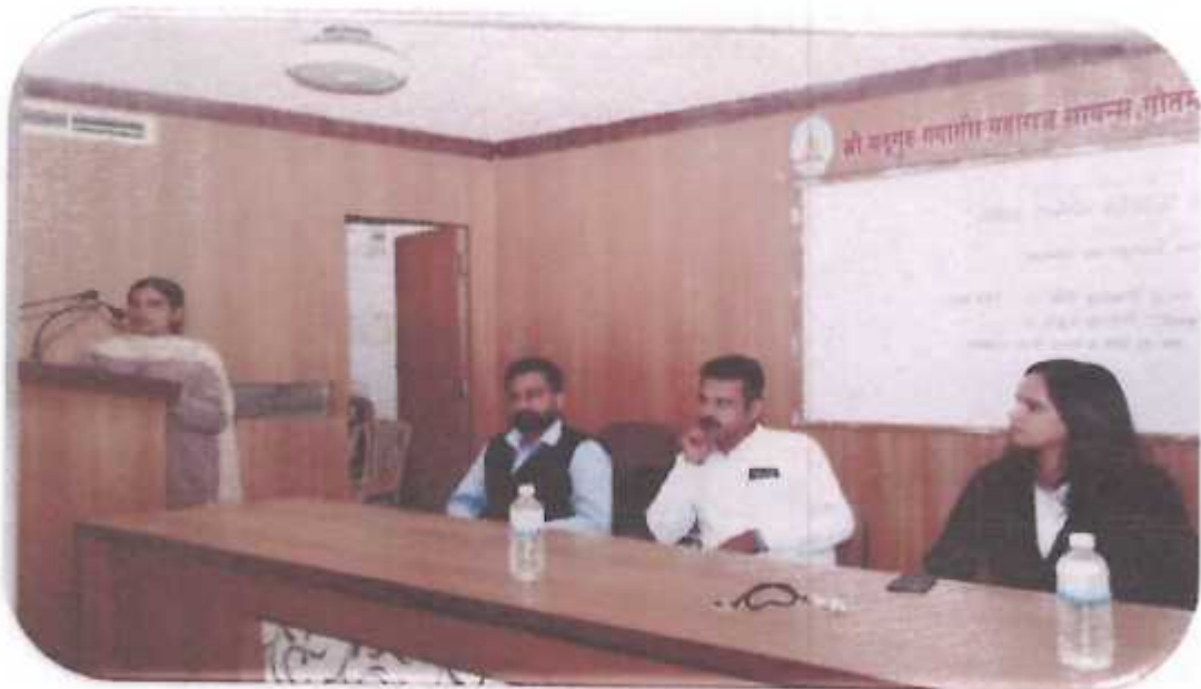
Guest Lecture on Career Development in Banking Sector Monday 3 rd February 2020 at 09:30 am. to 10: 30 am.